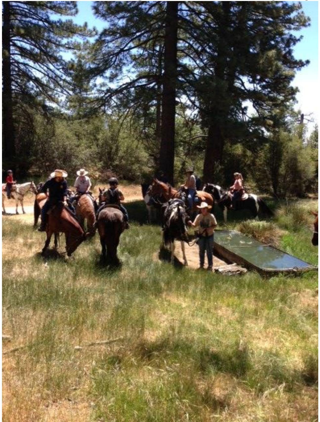
McCall's - 2013 - Saturday Ride - "At the Watering Trough"